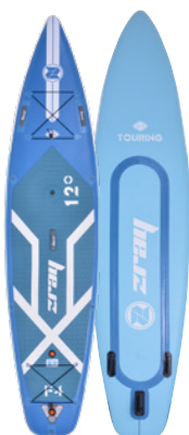
FURY EPIC 12'