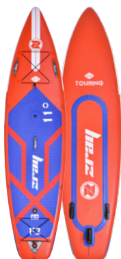
FURY PRO 11'