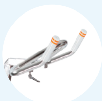
45° sport handlebar