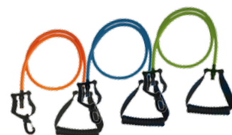
RESISTANCE BANDS 3 LEVELS AVAILABLE