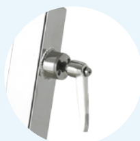
Fast settings Click & Turn