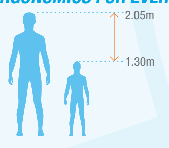
Lack User up to 200kg