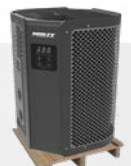
Delivered on a wooden pallet