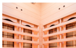
Personalized Quartz transmitters with individual ON/OFF switch