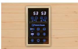
New generation digital control panel