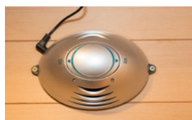
Cabin purification with ionizer